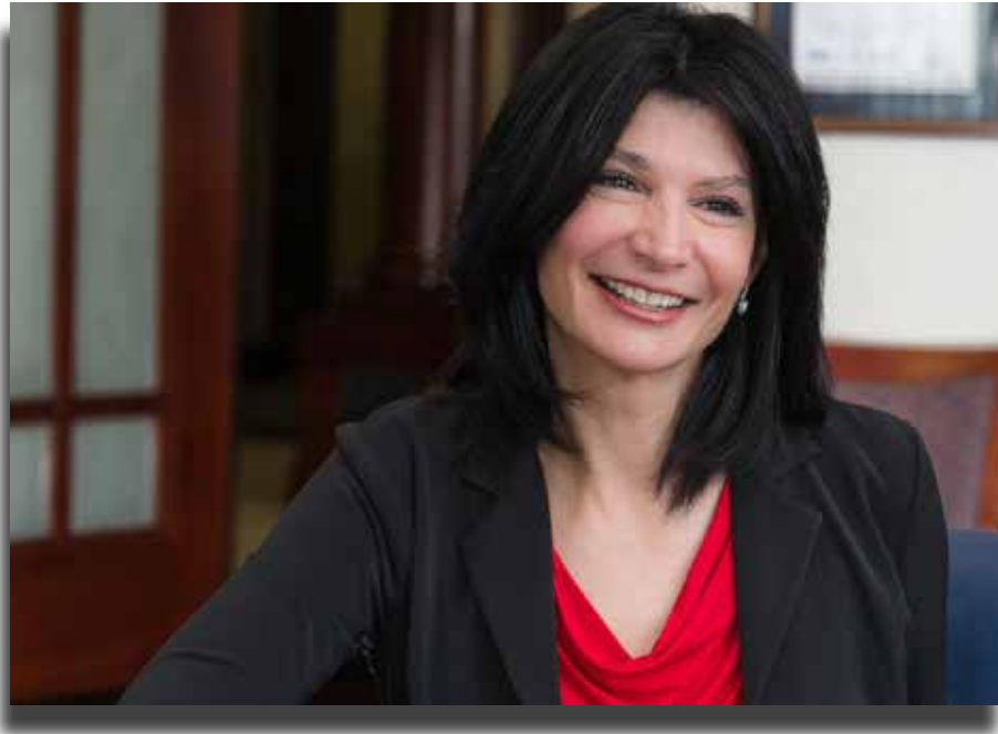
Lily Eskelsen García

Lily started her career in education as a lunch lady in a school kitchen and a teacher's assistant in a Head Start preschool. She worked her way through the University of Utah on student loans and as a starving folk singer, graduating magna cum laude in Elementary Education and later earning her Master's in Instructional Technology. After only nine years teaching, she was named Utah Teacher of the Year and expanded her service outside her classroom. She won election as president of her state education association, won her party's nomination for U.S. Congress, and served as president of the Utah State Retirement System. She was appointed a Commissioner for the White House Commission for Education Excellence for Hispanics under President Obama and served as an officer for the Congressional Hispanic Caucus Institute. Her service continues as Vice President of the global education advocacy organization, Education International, based in Brussels. She completed her service as president of America's largest professional union, the 3-million-member National Education Association, retiring in 2020.